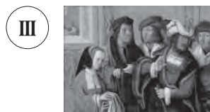
23 Lucas van Leyden Potiphar's Wife Displays Joseph's Garment