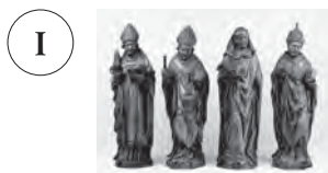
I Master Arnt van Zwolle (?) The Four Fathers of the Church; St Augustine, St Ambrose, St Jerome, St Gregory

With the cooperation of: KLM Royal Dutch Airlines, Nippon Cargo Airlines Co., LTD., Daikin Foundation for Contemporary Art