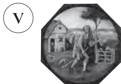
41 Jheronimus Bosch The Pedlar