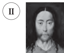
8 Dieric Bouts Head of Christ