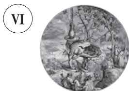
51 Jheronimus Bosch Etched by an unknown artist The Tree Man