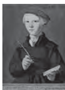
38 Jan van Scorel Portrait of a Young Student