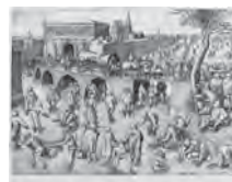
73 Pieter Bruegel I Engraved by Frans Huys Ice Skating before the Gate of St George in Antwerp