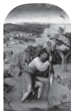
42 Jheronimus Bosch St Christopher Carrying the Christ Child