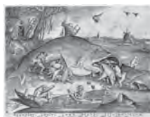
66 Pieter Bruegel I Engraved by Pieter van der Heyden Big Fish Eat Little Fish